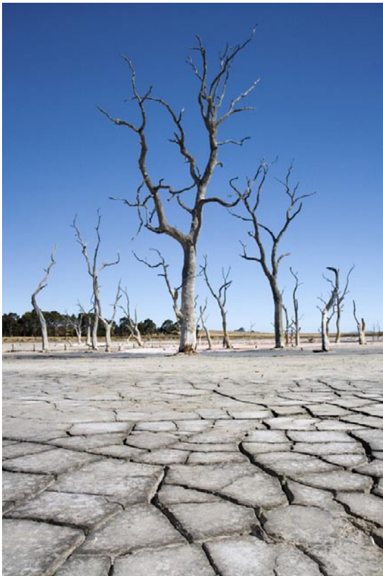
2007 winner Rodney Dekker, 1 of 10 in the series Drought .